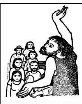
DAILY GOSPEL READINGS