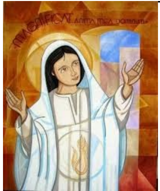
DAILY GOSPEL READINGS