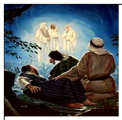
DAILY GOSPEL READINGS March 18-22, 2019