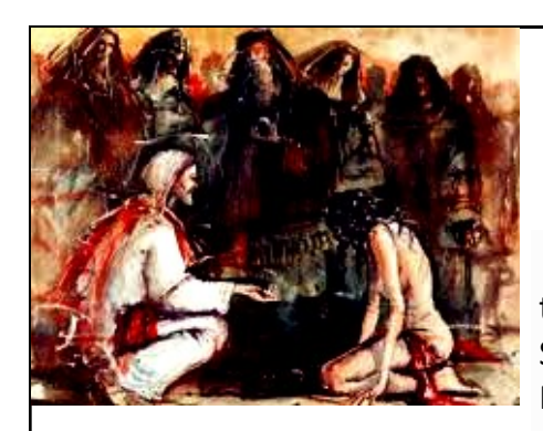
DAILY GOSPEL READINGS April 8-12, 2019