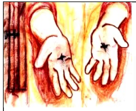
DAILY GOSPEL READINGS April 29 - May 3, 2019