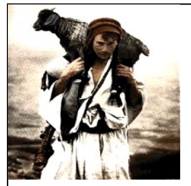
DAILY GOSPEL READINGS May 13-17, 2019