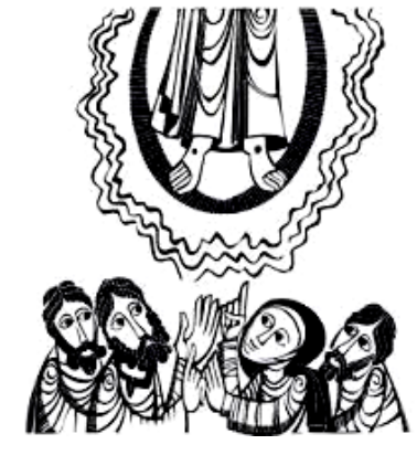
DAILY GOSPEL READINGS