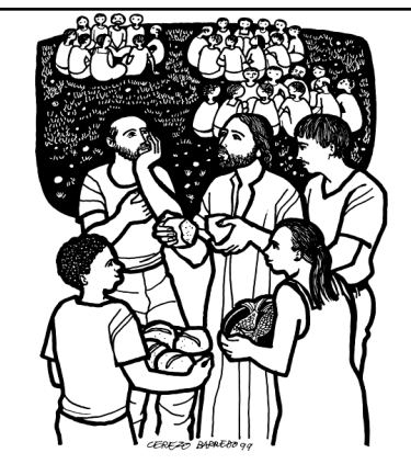
DAILY GOSPEL READINGS June 24-28, 2019

Mon: Luke 1:57-66, 80 Tues: Matt 7:6, 12-14 Wed: Matt 7:15-20 Thurs: Matt 7:21-29 Fri: Luke 15:3-7