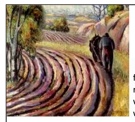
DAILY GOSPEL READINGS July 1-5, 2019

Mon: Matt 8:18-22 Tues: Matt 8:23-27 Wed: John 20:24-29 Thurs: Matt 9:1-8 Fri: Matt 9:9-13