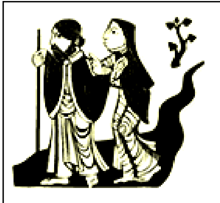
DAILY GOSPEL READINGS July 8-12, 2019

Mon: Matt 9:18-26 Tues: Matt 9:32-38 Wed: Matt 10:1-7 Thurs: Matt 10:7-15 Fri: Matt 10:16-23