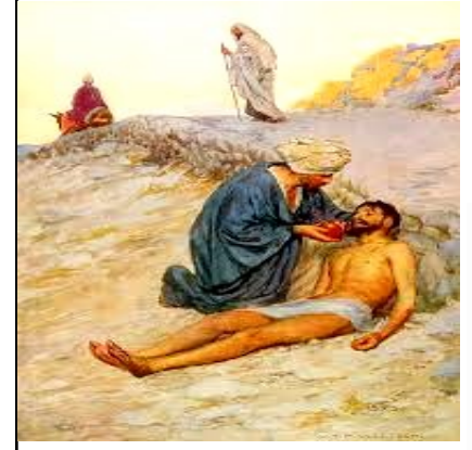
DAILY GOSPEL READINGS July 15-19, 2019

Mon: Matt 10:34-11:1 Tues: Matt 11:20-24 Wed: Matt 11:25-27 Thurs: Matt 11:28-30 Fri: Matt 12:1-8