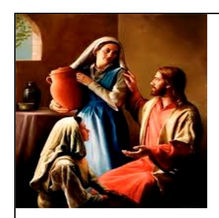
DAILY GOSPEL READINGS July 22-26, 2019

Mon: John 20:1-2, 11-18 Tues: Matt 12:46-50 Wed: Matt 13:1-9 Thurs: Matt 20:20-28 Fri: Matt 13:18-23