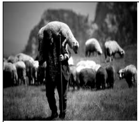
DAILY GOSPEL READINGS September 16-20, 2019

Mon: Luke 7:1-10 Tues: Luke 7:11-17 Wed: Luke 7:31-35 Thurs: Luke 7:36-50 Fri: Luke 8:1-3