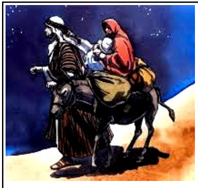
DAILY GOSPEL READINGS