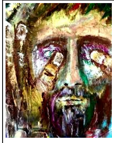
DAILY GOSPEL READINGS THIS WEEK

Monday: John 4:43-54 Tuesday: John 5:1-16 Wed: Luke 1:26-38 Thurs: John 5:31-47