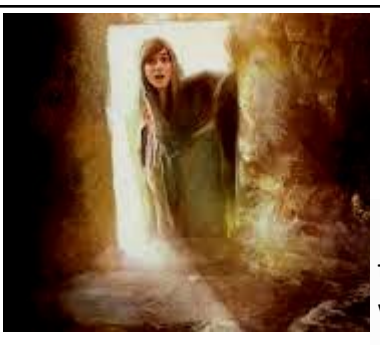
OCTAVE OF EASTER READINGS

Monday: Matt 28:8-15 Tuesday: John 20:11-18 Wed: Luke 24:13-35 Thursday: Luke 24:35-48 Friday: John 21:1-14