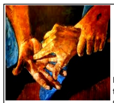
SECOND WEEK OF EASTER GOSPELS