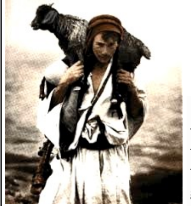
FOURTH WEEK OF EASTER GOSPELS

Monday: John 10:11-18 Tuesday: John 10:22-30