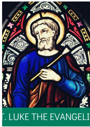
LUKE THE EVANGELIST

Early historians said this author of the third Gospel and the Acts of the Apostles was born to a pagan family in Antioch (Turkey) and converted to Christianity. According to Paul's letters and Acts, he was a doctor and Paul's companion during his later journeys and imprisonment in Rome. Luke's New Testament writings in Greek were for gentiles, extending to them the salvation promised to Israel. He is the patron of physicians and surgeons and, because of a legend that he painted a Marian icon, of painters. Copyright © 2021, United States Conference of Catholic Bishops, Washington, DC. All rights reserved