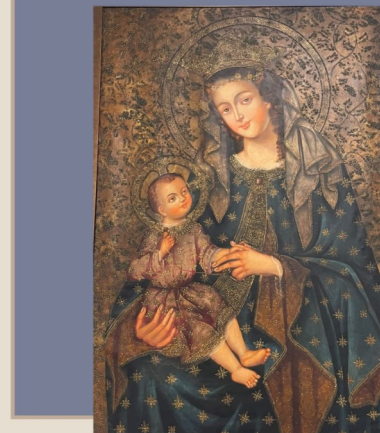
BLESSING OF THE PAINTING OF OUR LADY

"DEDICATION OF DONORS PLAQUE" FOR OUR PARISH HALL