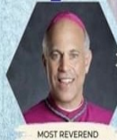
MOST REVEREND SALVATORE CORDILIONE