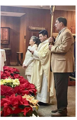
mission of care and unity.